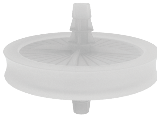
25H-1705-FLS Vent filter, 0.2µm, 45mm, Non-Sterile

Housed inside the USP Class VI polypropylene body, a hydrophobic PTFE membrane traps aerosolized bacteria and prevents flow of aqueous solutions, allowing for the creation and maintenance of aseptic, closed systems. The membrane is reinforced with a specialized polypropylene support, meaning EZBio® Vent Filters can even be sterilized by gamma irradiation.